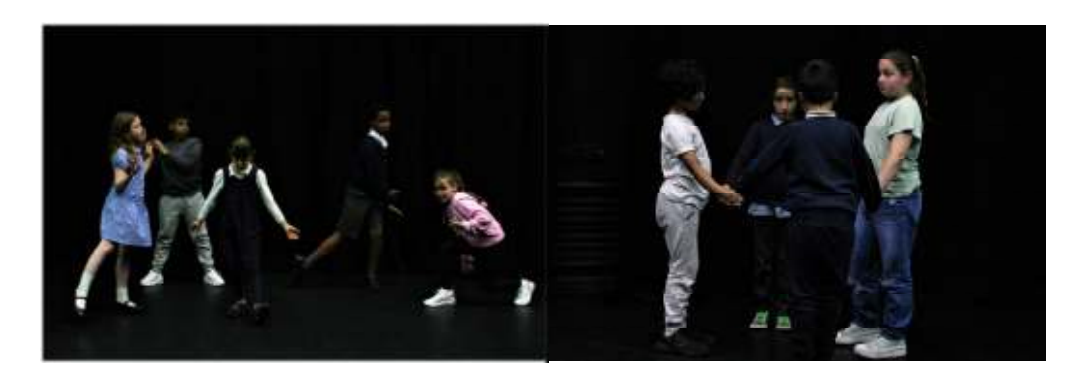
Equinox have worked really hard this term. Their energy, creativity, commitment and kindness have shone through.

Equinox looked at a series of images and used the poem Journey by Barbara Vance to workshop ideas about what the word 'Journey' means to them. They used non-verbal communication to create interesting shapes to express emotions, feelings and meaning. They worked supportively to create different role-plays.